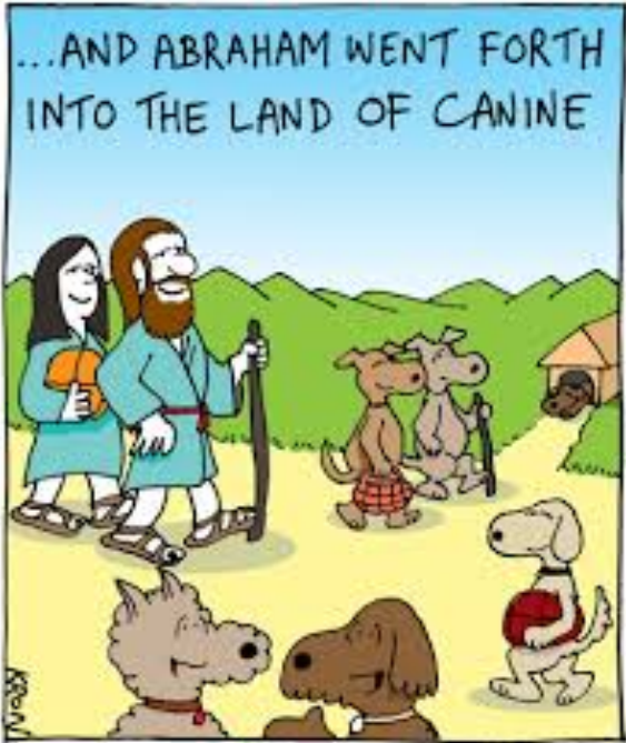
The CARTOON KRONICLES

FUNNY BONES – USING UP ONES THAT I HAVE BEEN SAVING FOR A GOOD MOMENT TO SHARE