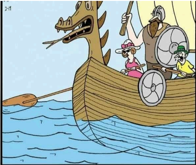
"I specifically told you to book a cruise with Carnival, but you just had to go with Viking."